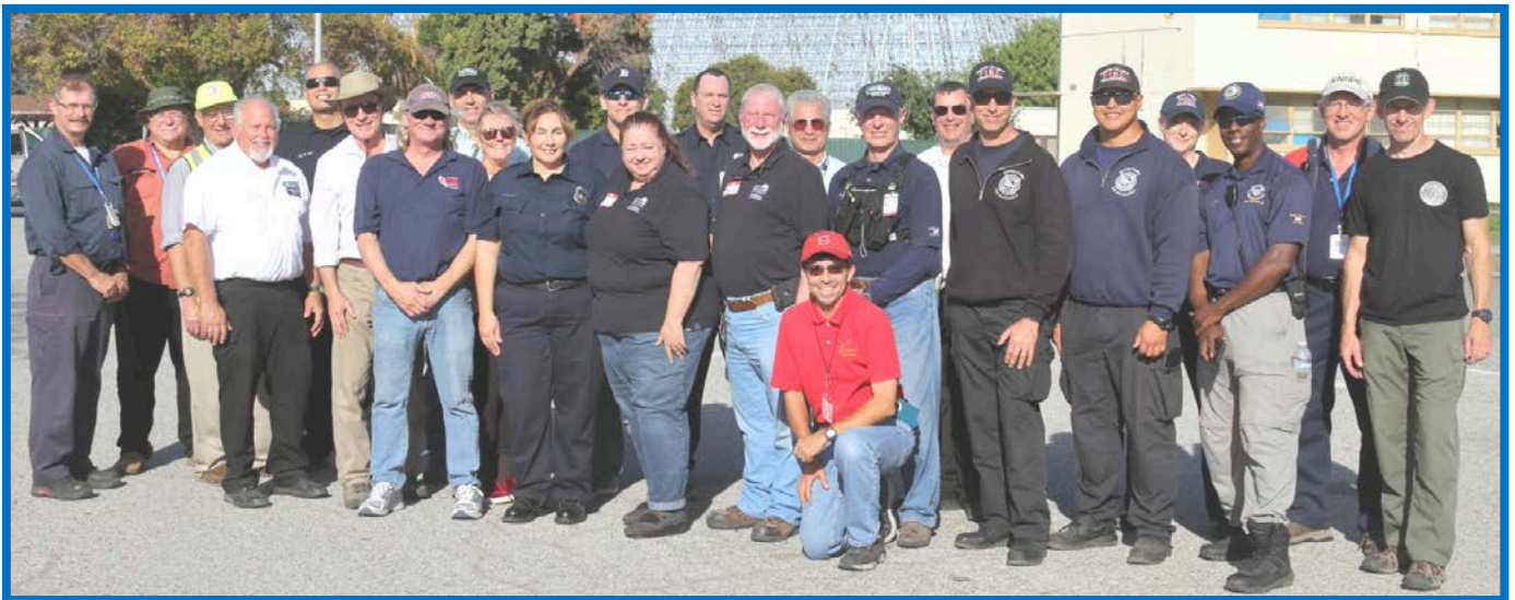
( Pictured is the CERT Subcommittee for the exercise)

Amateur Radio Emergency Service (ARES) and Community Emergency Response Team (CERT) volunteers were out in force at the countywide CERT emergency simulation on Saturday, October 27 at Moffett Field. A total of 91 participants from Campbell, Cupertino, Los Altos, Los Altos Hills, Milpitas, Morgan Hill, Palo Alto, San Jose, Santa Clara, Saratoga, and Sunnyvale participated in the daylong drill.