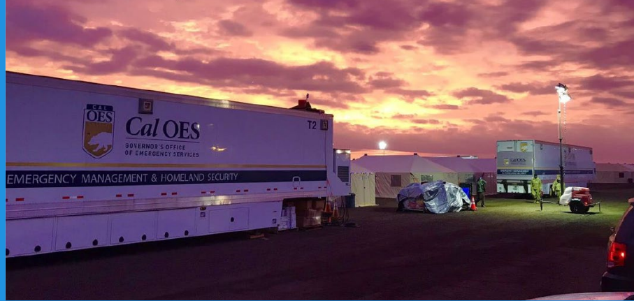
Base Camp for response to the Camp Fire, Butte County